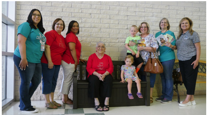
Lomax Middle School