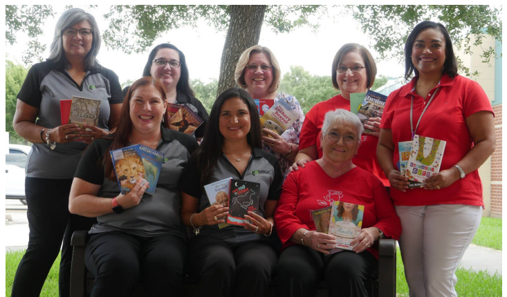
Dezavala Middle School