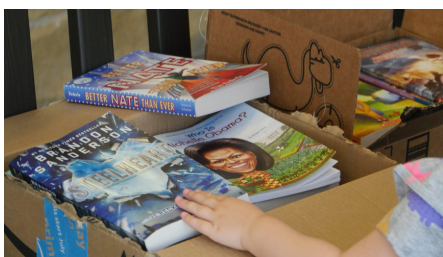
Boxes of Books